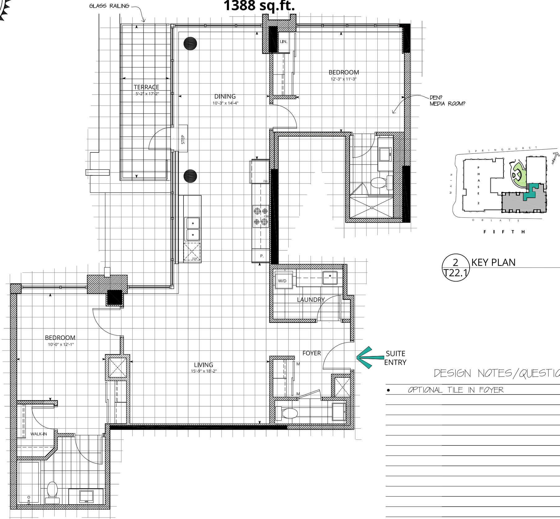
1 THE BURNHAM T22.1