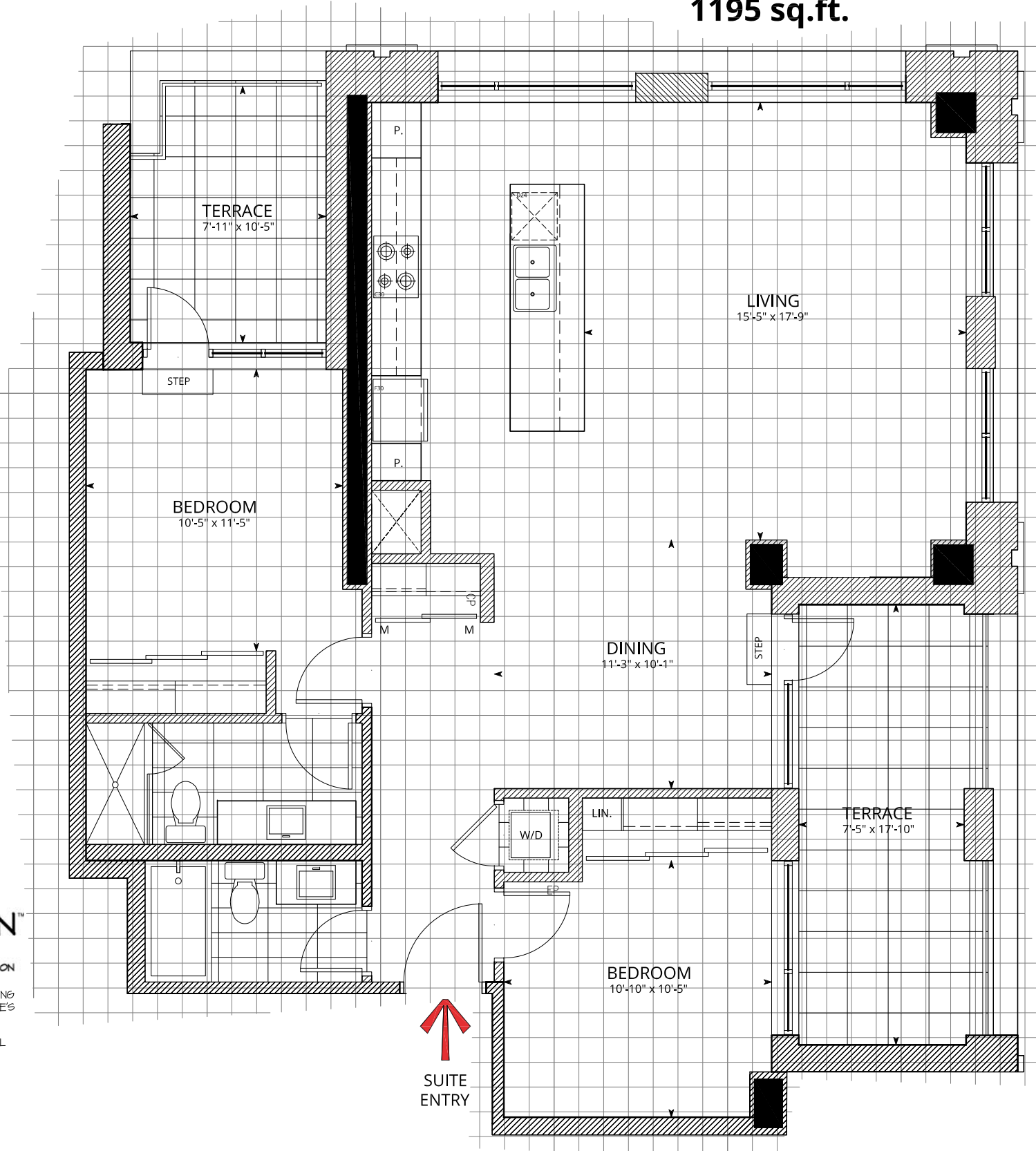
1 THE BELLWOOD T3.1